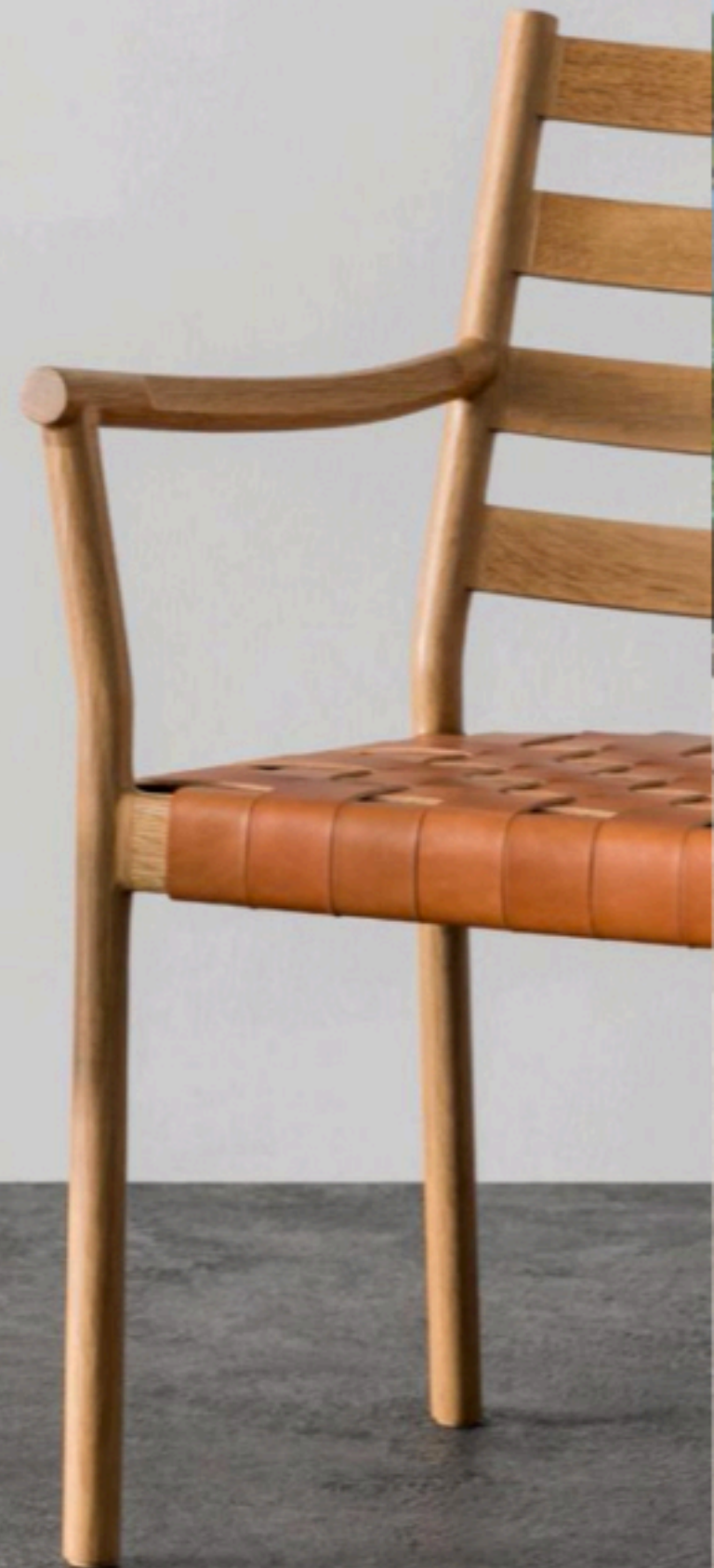
Thos. Moser Hancock Chair