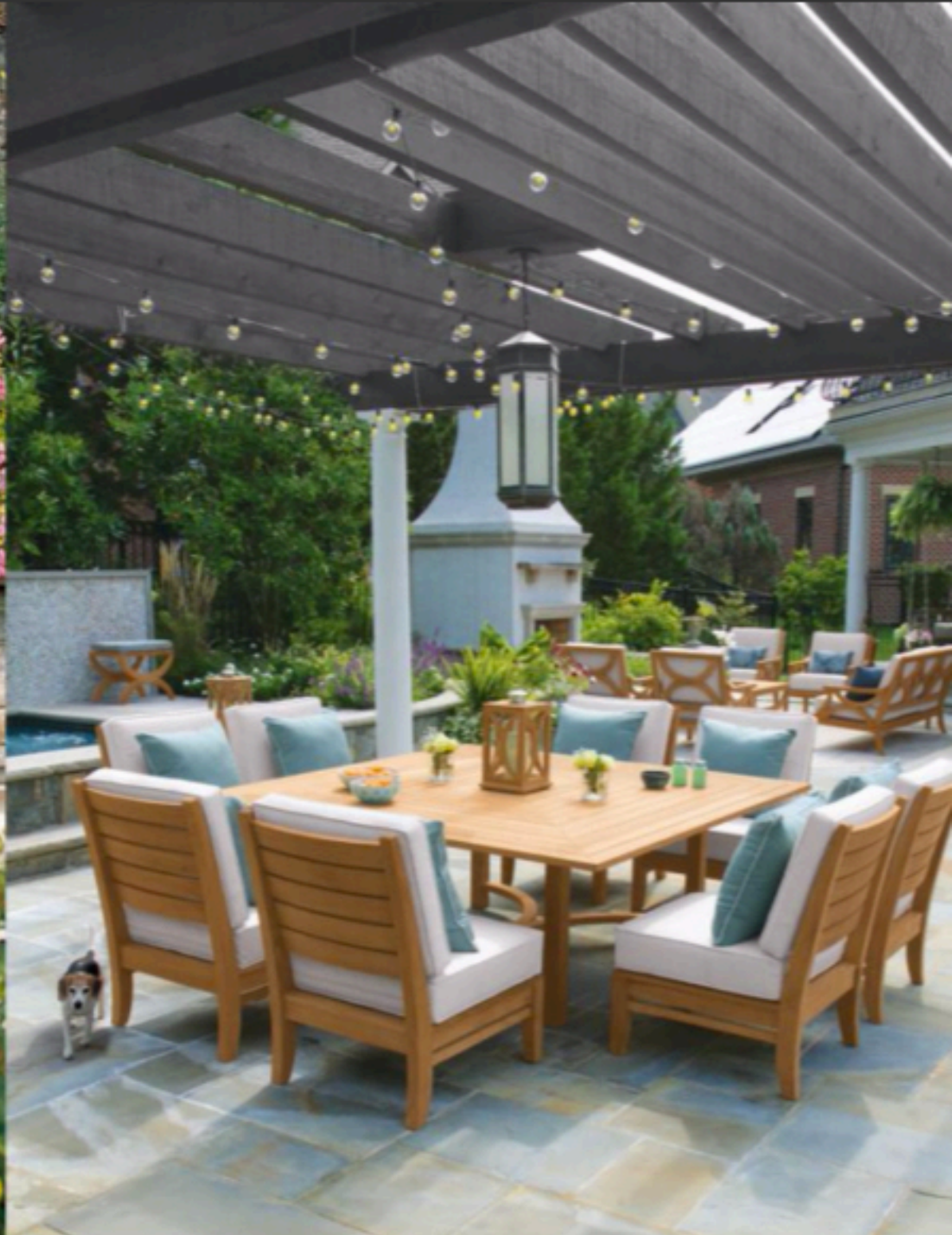
Top Left: Country Casual Teak Brittany Bench Top Right: Country Casual Teak Fiori Square Table Below: Country Casual Teak Casita Sectional Right: Country Casual Teak Salon Loveseat